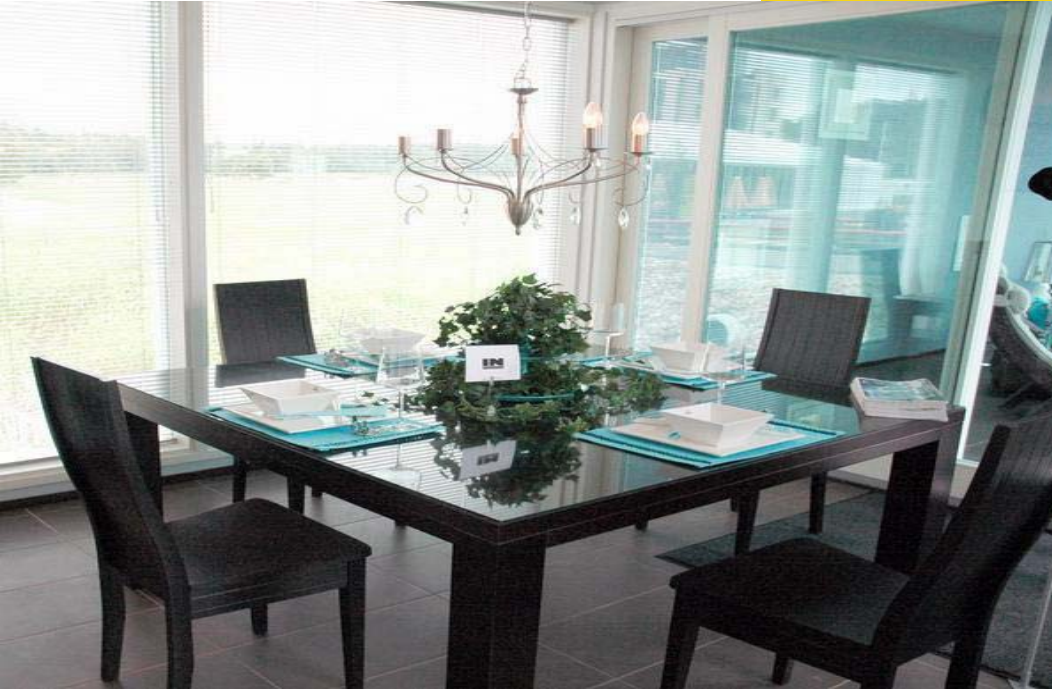
Private Residence, Helsinki