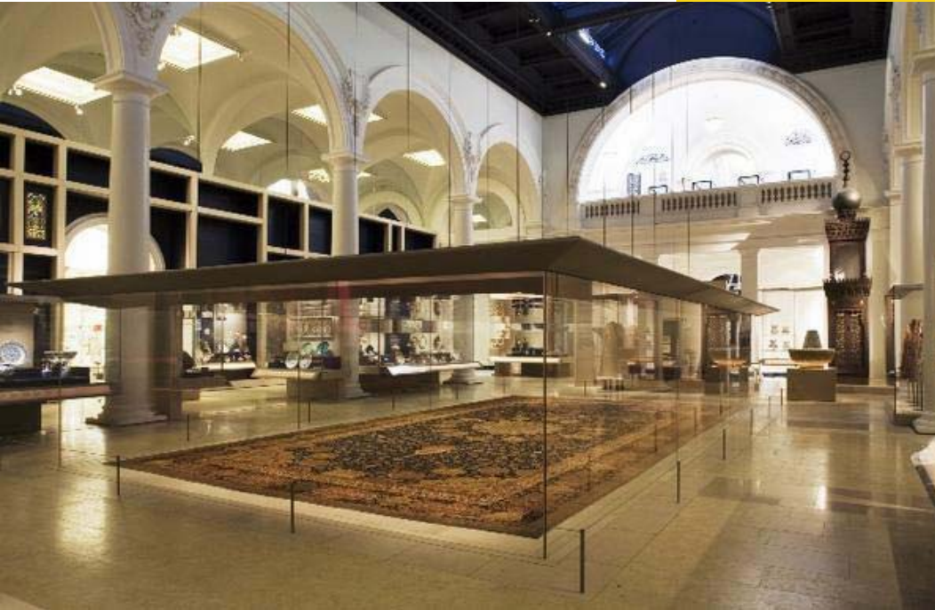
Islamic Gallery, Victoria & Albert Museum, London