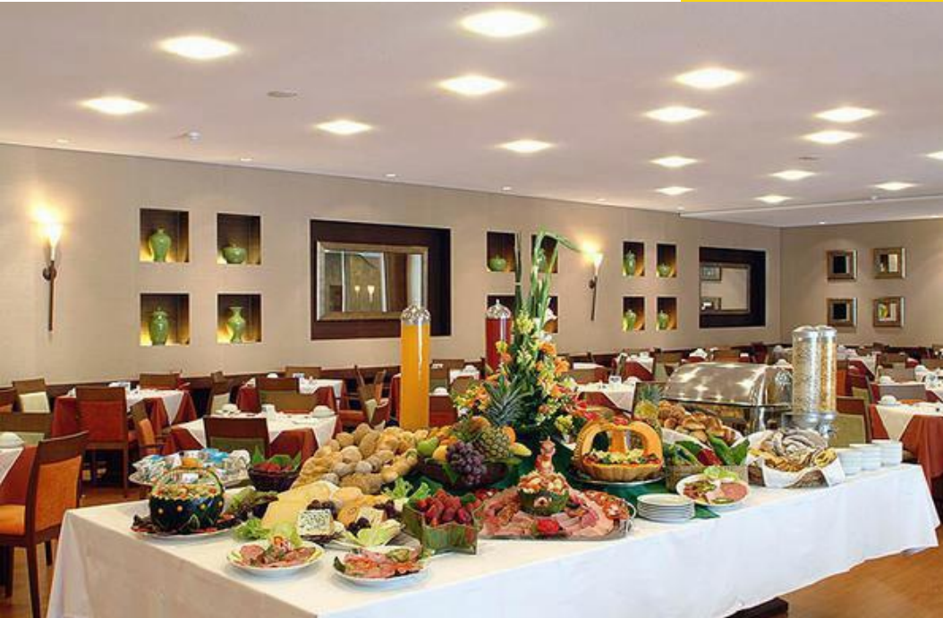
Hotel Fenix, Lisbon