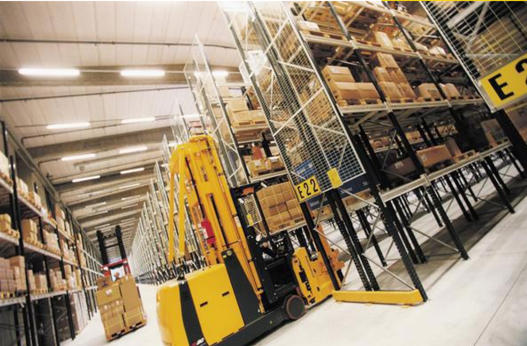
Bildarkiv Central Warehouse, Sweden