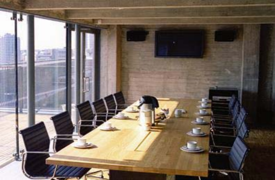
Office Building, Helsinki